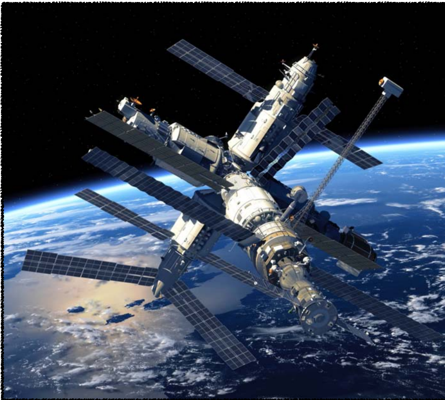
The ISS orbiting The Earth.

The International Space Station (ISS) travels in Earth's orbit. It is made up of smaller sections that were joined together in space. The main section was sent into space by a Russian rocket in 1998 and the ISS was completed in 2011.