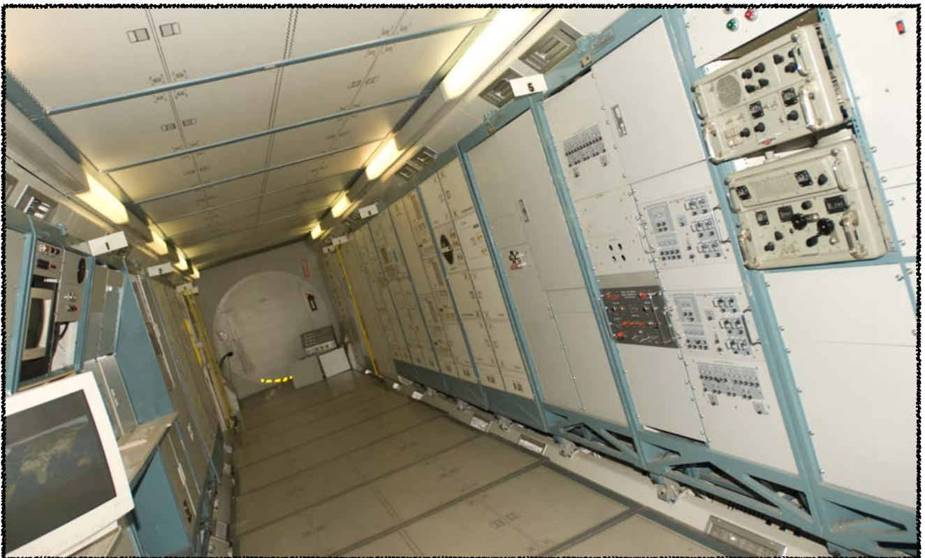
Inside the ISS.

The ISS completes 15.54 orbits of the Earth per day.