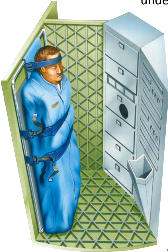
An astronaut asleep standing up.

Scientists carry out experiments there and NASA uses it to understand more about living and working in space. It is also used to test equipment that is needed for missions to The Moon and Mars.